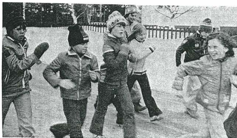
The Swedes have great enthusiasm for race walking and tremendous participation in the sport. Witness this picture from Gangsport, their national race walking magazine. It is captioned "Varvintertraning i Nederhogen."